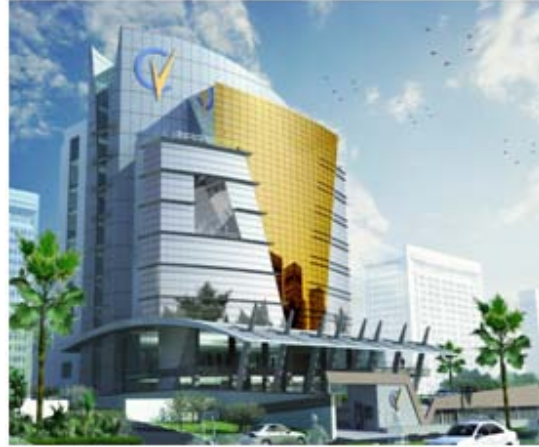
Course View Tower, Kampala