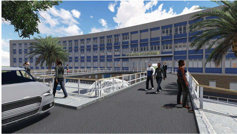
Mulago Hospital - Kampala