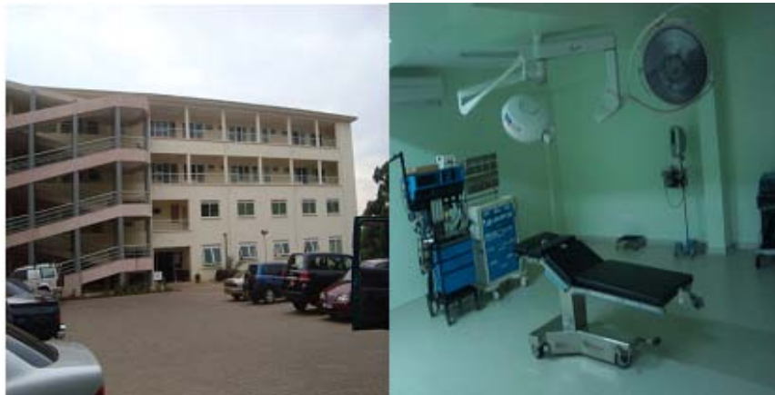
Nakasero Hospital Kampala