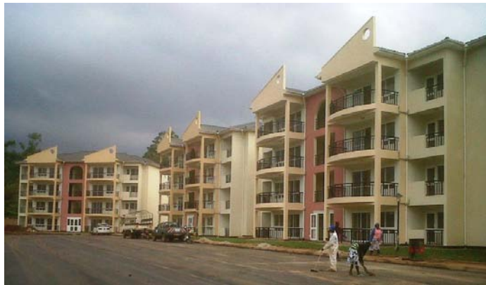
Spring Valley Apartments, Kampala