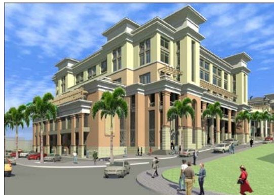
The Acacia Mall, Kampala