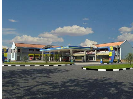
City Oil Petrol Station, Kira Rd, Kampala