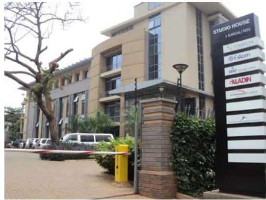
Studio House, Bugolobi, Kampala