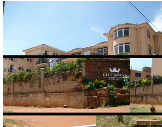
City Royal Hotel, Bugolobi