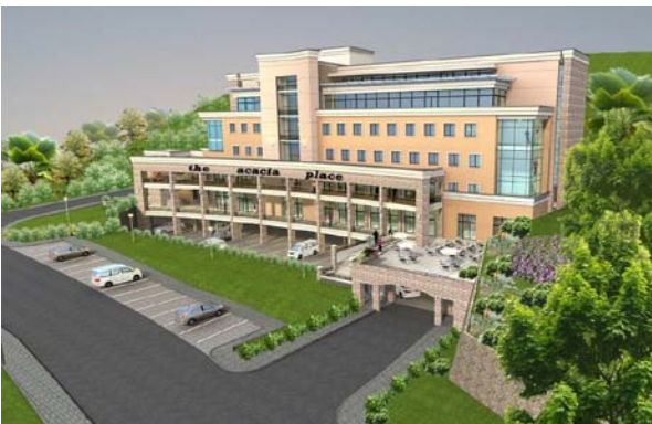
The Acacia Place, Kampala