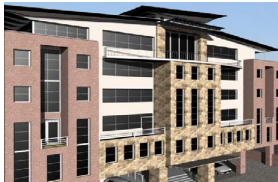
Proposed Office Block on Kira Road