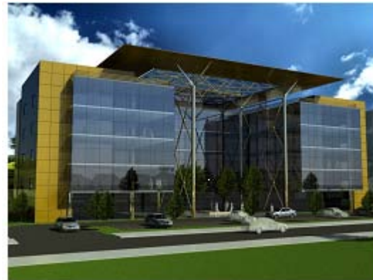
Hoid Towers, Kampala