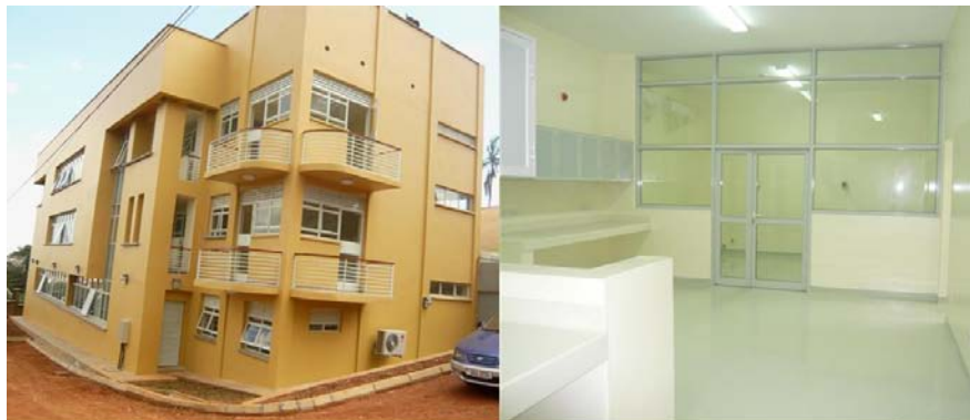
Uganda Blood Transfusion (Blood Bank), Kampala