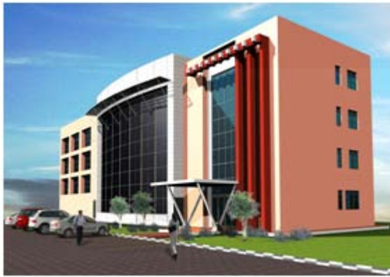
Uganda Broadcasting TV Complex, Kampala