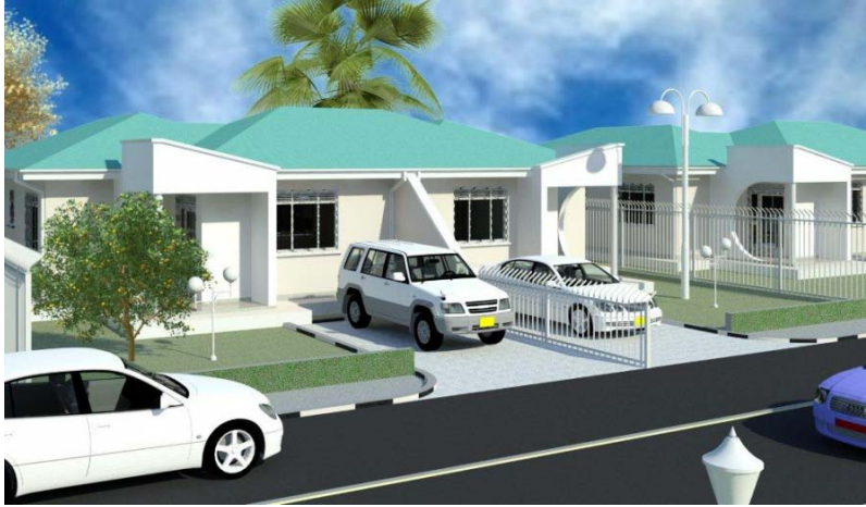
Bukerere Housing Project - Wakiso