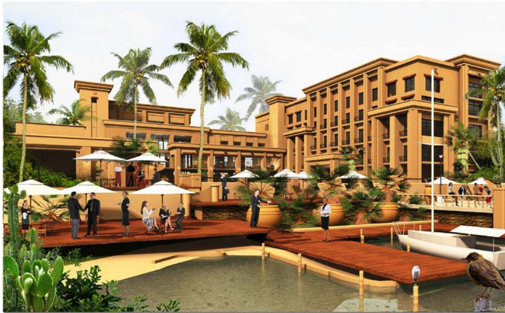
Emin Pasha Hotel, Juba