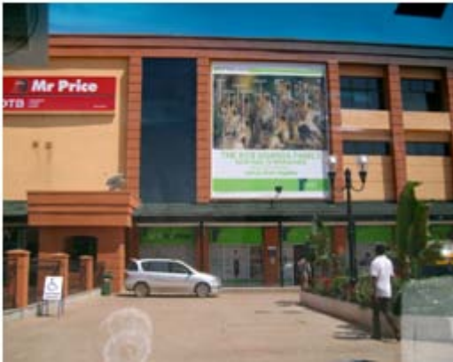
KCB Bank, Oasis Mall, Kampala