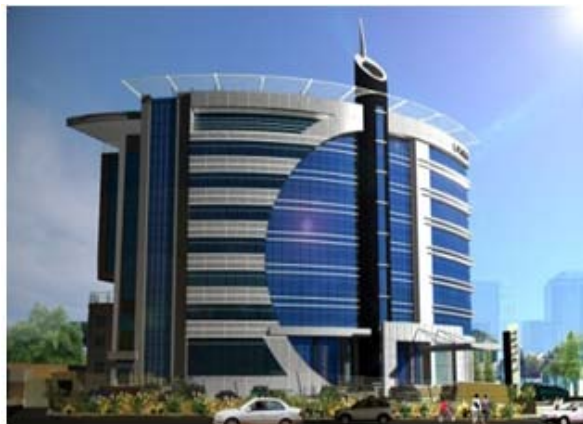
Office Block, Lourdel Road, Kampala