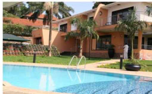
Damani Residence on Plot 1C Prince Charles Drive Kololo, Kampala