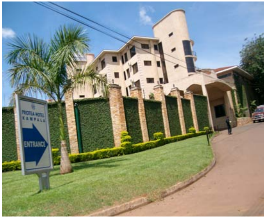
Protea Hotel, Kampala