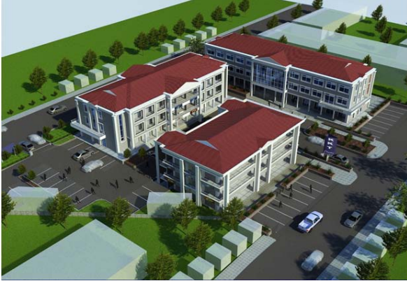
KKT Shopping Complex, Arua