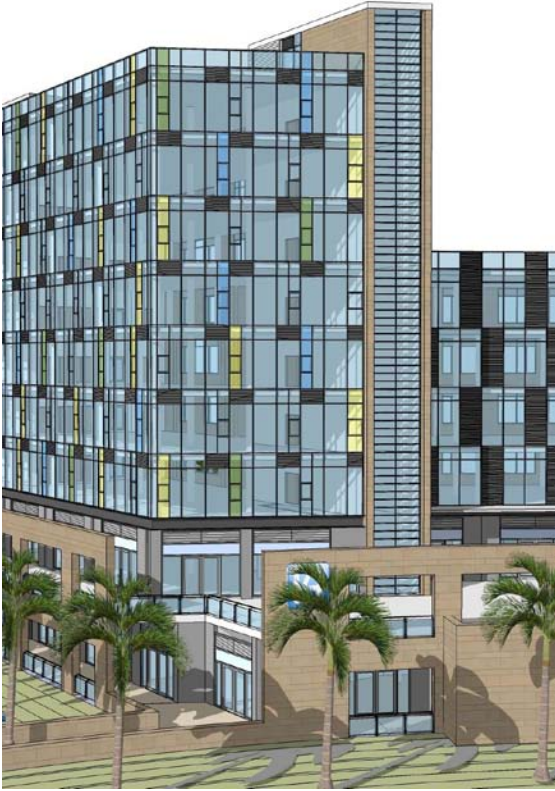
Kigali Heights, Kimihurura, Kigali, Rwanda