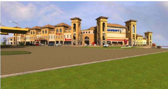
Bugolobi Village Mall, Kampala