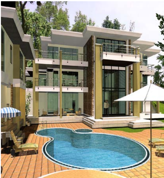
Residential House at Plot 11 Hill Lane, Kololo, Kampala