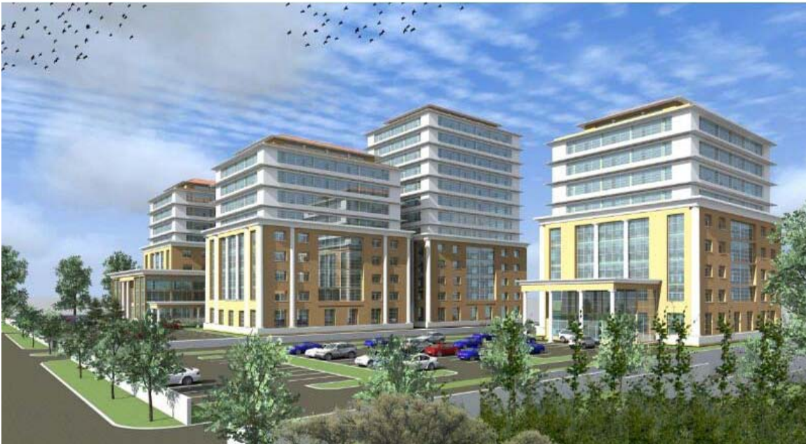
Proposed JLOS and Criminal Court Building, Naguru, Kampala