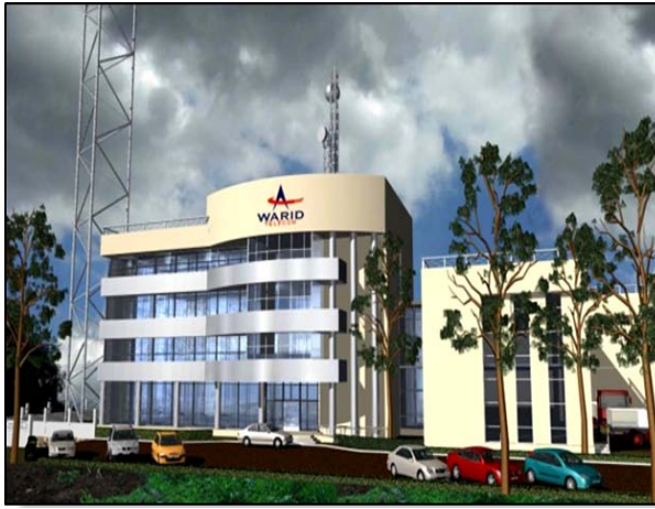
Warid Office, Kampala