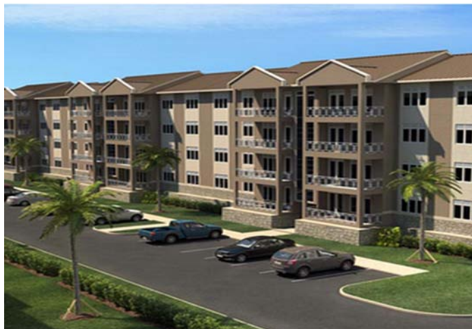
Sunset Apartments, Kiwatule, Kampala