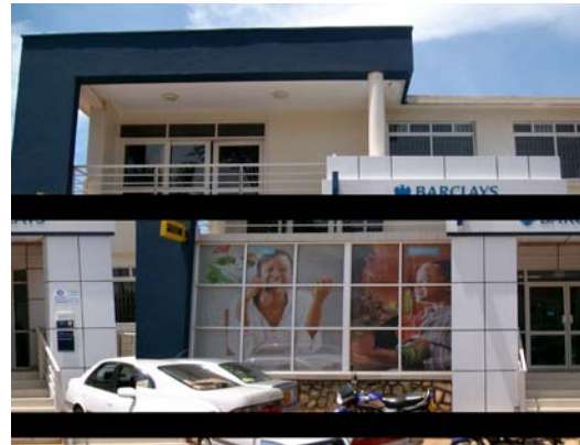
Barclays Bank, Bugolobi Branch